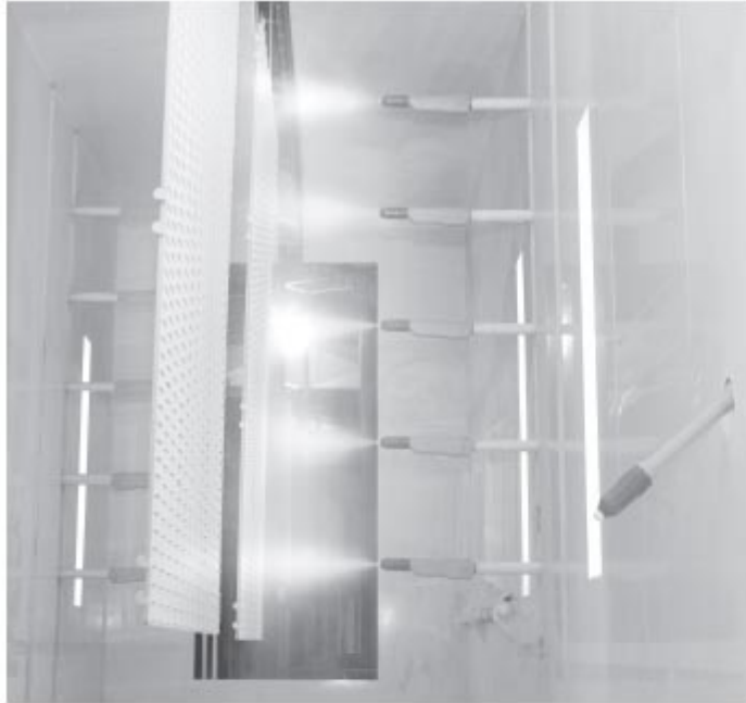
Above: An interior view of the powder booth's automatic guns during a coating process.