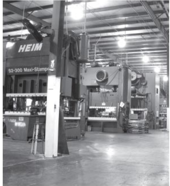
Above: A row of stamping presses at American Products' Strafford, Missouri facility.

The company also offers in-house product development and