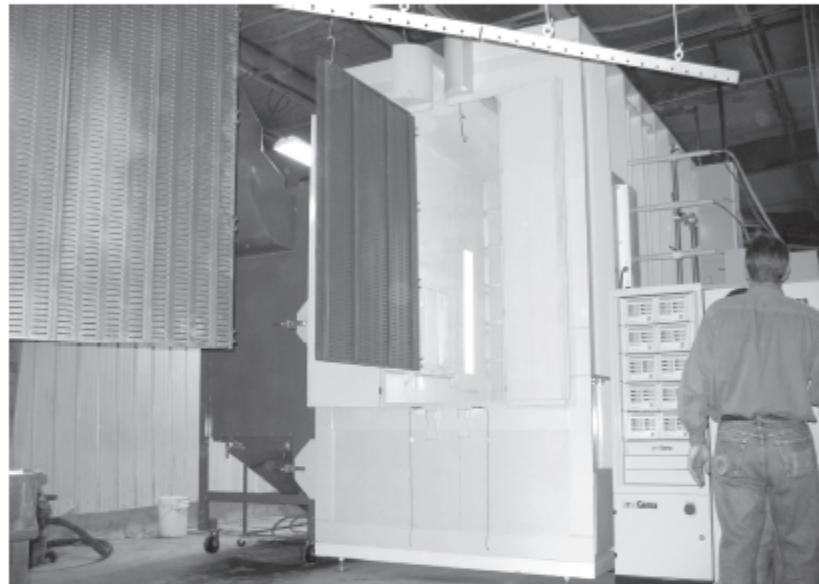
Above: American Products' new Vortech Plus series powder coating booth. Below: Parts fabricated and finished at the company's Strafford facility.

American Product's new powder booth, one of the first of its type in North America, is part of one of the company's two conveyerized lines. It has such advanced features as: a mini-cyclone separation system; automatic guns; part-scanning